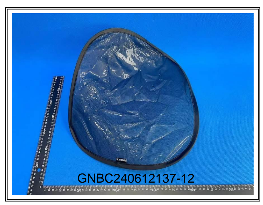
GIG authenticate the photo(s) on original report only